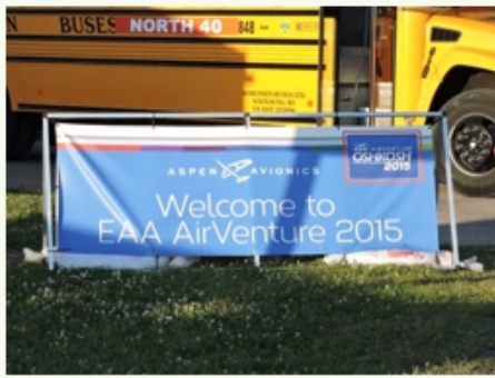
It's so big they use buses to take people around