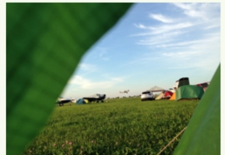
This is your 6am wake-up call. Waking up to Mustangs taking off, pretty sweet!

I'm sure that she'll be more than happy to show you more of her snaps and stories when she's back at the end of August if you pop down and see us.