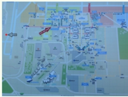
Not quite a full map, but we're camped by the left arrow