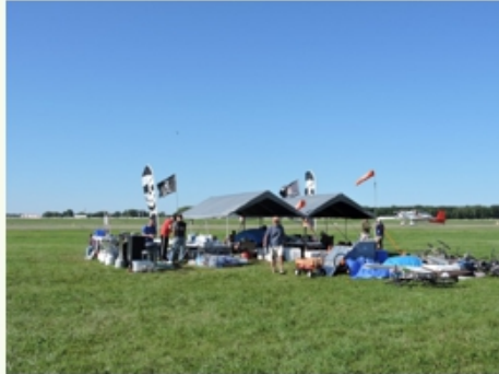
The sweet set-up I stumbled into