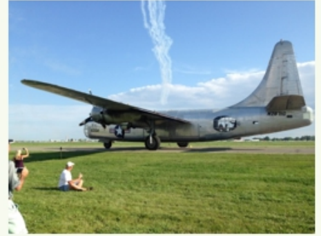
Yes, that is a B-52 passing by our site