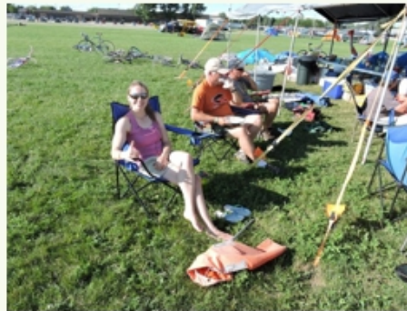
Yep, it was a good decision